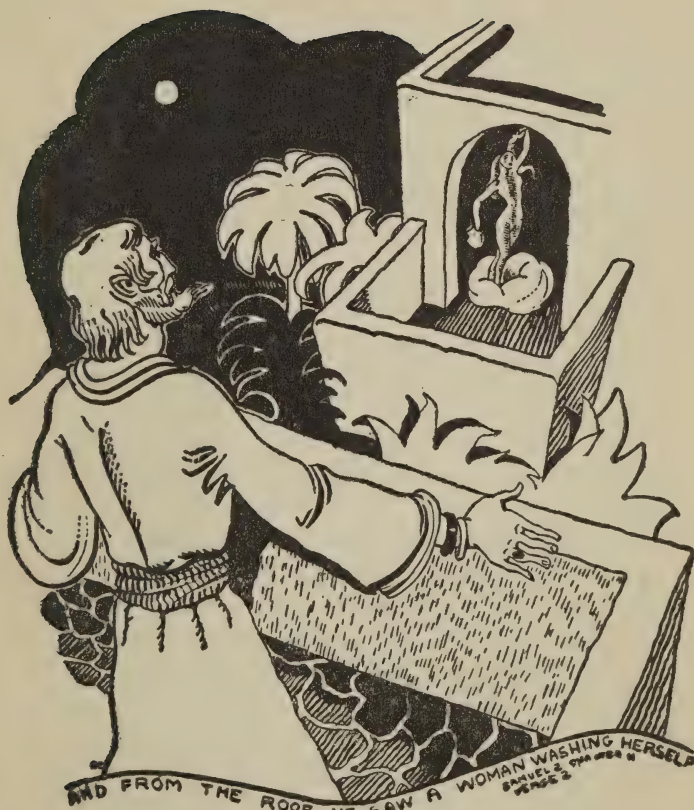
AND FROM THE ROOF HE SAW A WOMAN WASHING HERSELF SAMUEL 2 CHAPTER 11 VERSE 2